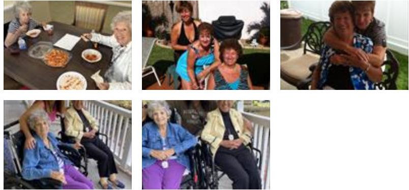
Rosemarie - March 20, 2025 at 08:54 PM